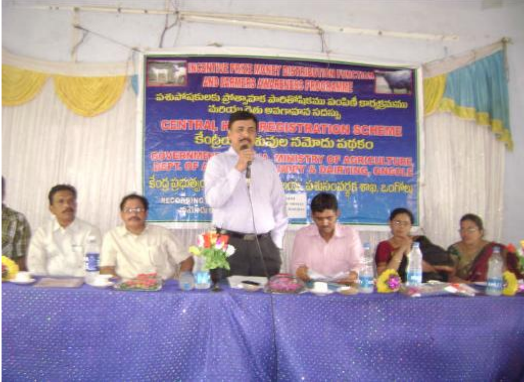
Director (AH), Government of Andhra Pradesh addressing to breeders at Breeders Awareness and Publicity Camp organized by CHRS, Ongole Unit at Milk Recording Centre.

To popularize the scheme activities in the breeding tract, Publicity carried out by this unit. Small pamphlet in regional (Local) language prepared and widely circulated amongst the breeder in Breeder Awareness/ Publicity Camps which is organized under this unit in the breeding tract.