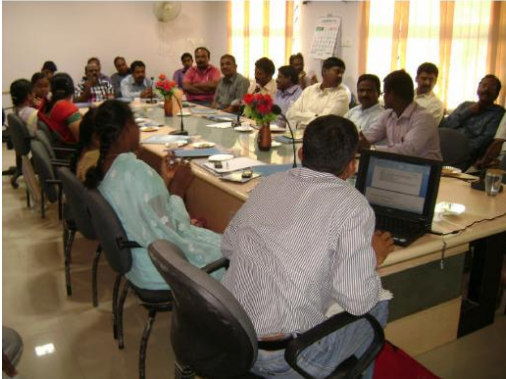
Imparting FPR training to the official of Tamil Nadu Livestock Development Agency, Chennai.

Under this unit impart training to the manpower of the states / State Implementing Agencies to initiate their own Field Performance Recording (FPR) to identify the superior germ plasm for the breeding purpose in the breeding tract.